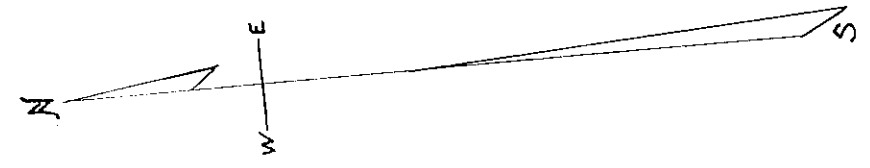
ST. CLAIR STREET EXTENSION THRU SHORELANDS N o 4 WILLOUGHBY TWP. SCALE 1" = 30'